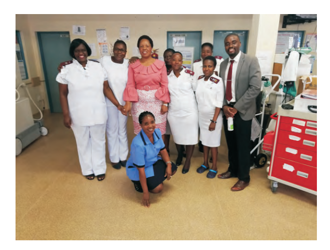
The Executive Mayor Nkakareng Rakgoale making a follow-up visit to the hospital, Nurses and Doctors appreciating her visit