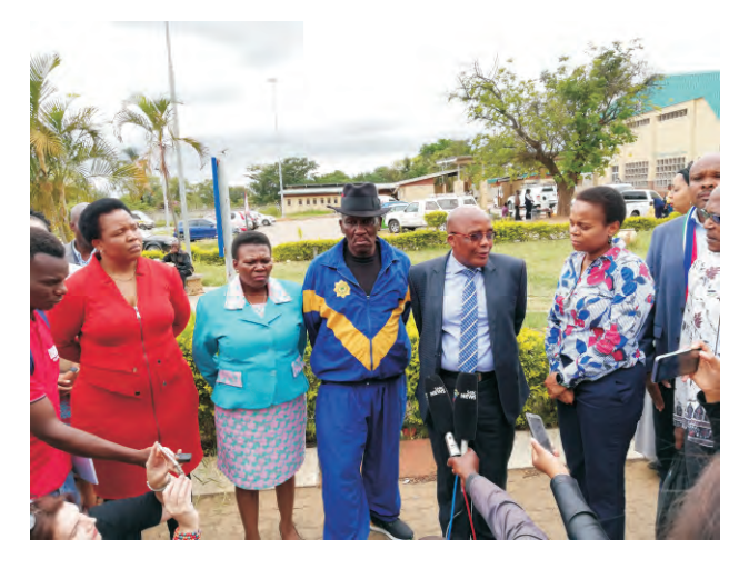
The political principals briefing the media just after the visit to the ICU.