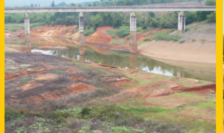
Low water levels at the Tzaneen Dam